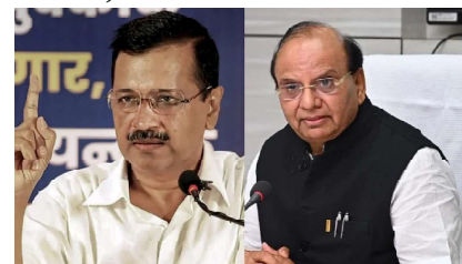
Delhi Chief Minister Arvind Kejriwal, Delhi Lieutenant Governor VK Saxena

received a report from the Chief Secretary in August which showed that serious discrepancies were made in the tender process. "There is gross violation of the Central Vigilance Commission's guidelines and general financial rules," the report said. It also added that the DIMTS was deliberately made a consultant so that the discrepancies in the tender process could be endorsed.